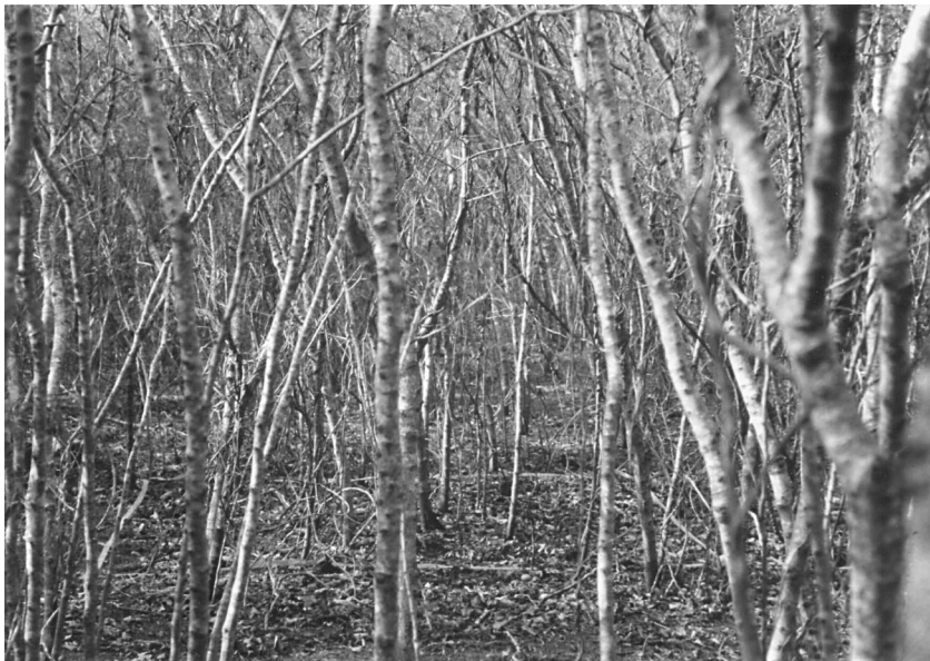
Fig. 2. A dense stand of Leucaena leucocephala along the airstrip on Mona Island.

Each piece of dead wood was split open and examined for any signs of termite activity. Termite galleries, termite fecal pellets, and/or body parts were noted as evidence of former termite activity. When live termites were observed, every attempt was made to collect the entire colony into 85% ethanol. Each entire colony collection was