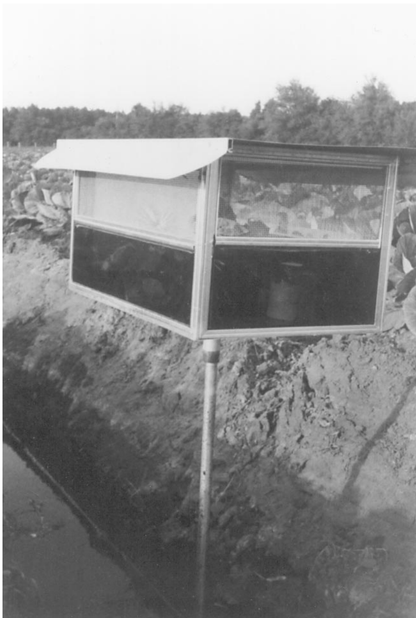
Fig. 2. Release station for Cotesia plutellae parasitoids. Cocoons or adult parasitoids were placed in open paper cups and set in the release cage next to a potted cabbage plant infested with diamondback moth larvae.