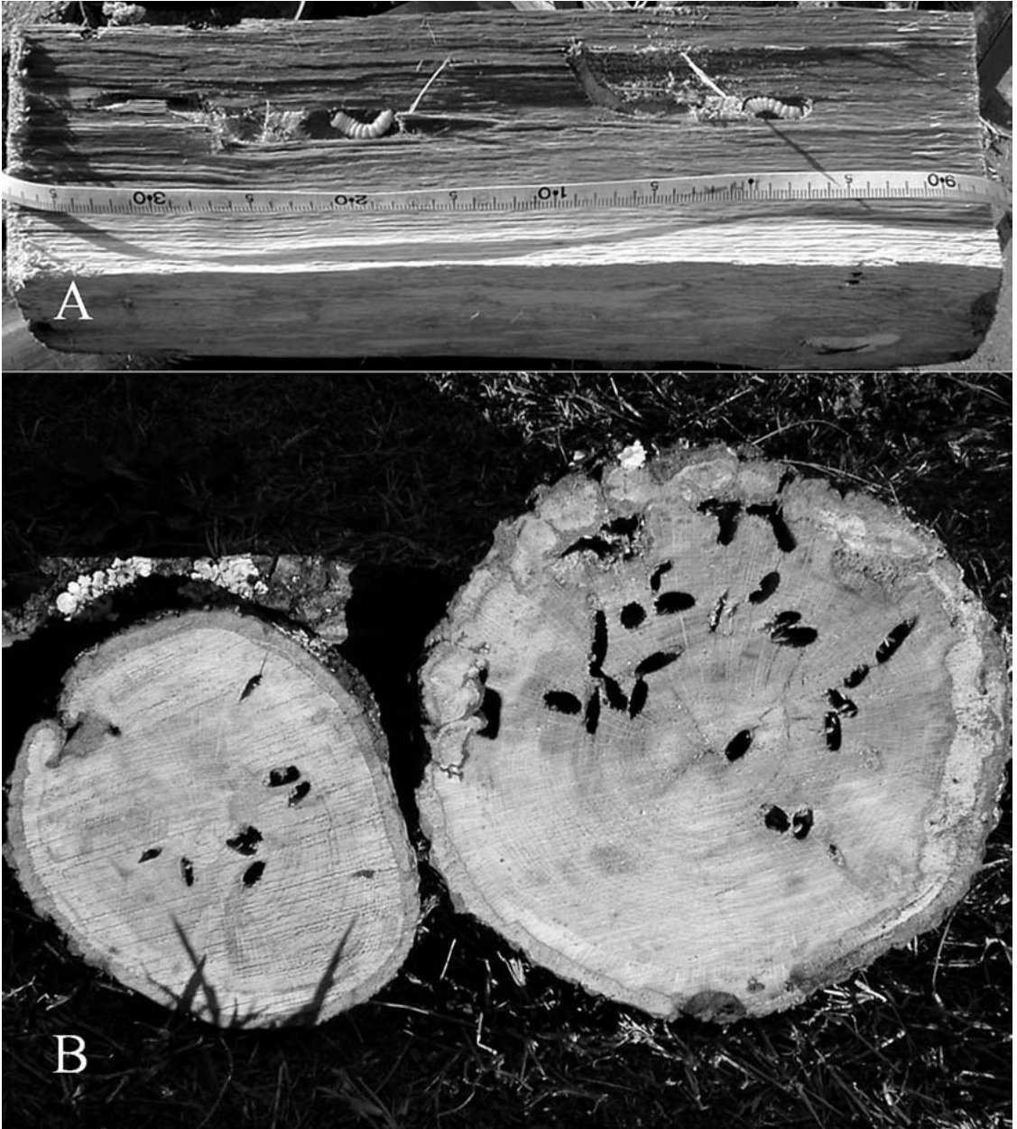
Fig. 1. Early-instar red oak borer larva phloem gallery (A) and cross-section of red oak borer xylem galleries (B).

All areas were systematically visited before red oak borer adult emergence, and potential sample trees were categorized into 1 of 3 infestation-history classes based on a rapid estimation procedure (Fierke et al. 2005b). This procedure was designed to estimate red oak borer infestation severity as a function of red oak borer emergence holes in the basal 2 m of the tree and visual estimates of percent crown dieback. Trees were felled at each site, cut into 0.5-m long bolts, beginning 0.5 m above